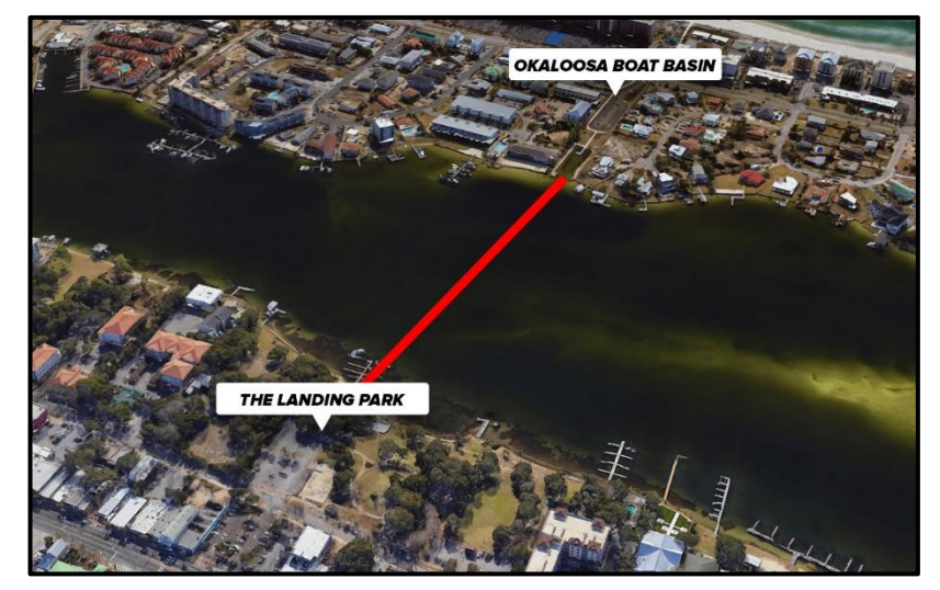
This is just a map showing the two potential ferry drop-off and pick-up locations. This is not official.

Mayor Dick Rynearson brought up the water ferry topic for discussion, having originated from Destin Mayor Bobby Wagner last month. Details on the ferry system remained vague, other than transporting passengers across Choctawhatchee Bay. In November, the Destin City Council voted to contribute funding to a study on a proposed ferry system between Destin and Fort Walton Beach.