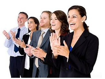
Standing Ovation Wuzzle No. 5