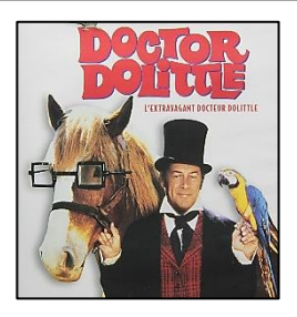
Doctor Doolittle Wuzzle No. 1

Members said the private sector could pursue and self-fund a Destin-related ferry if market demand exists, without city involvement. But for now, the council will focus its efforts on an Okaloosa Island-Fort Walton route.