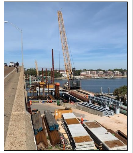
Brooks Bridge Pile Driver Okaloosa Island Side

Those of us who live close to the Brooks Bridge construction site are now treated to the "Music of the Pile Drivers". We are not complaining – after all, you can't make an omelet without breaking eggs, but it is hard not to get in "synch" with the "thud-bang" cadence of the pile drivers. In fact, some of us have developed the "pile driver twitch" by raising and dropping our shoulders in unison with the machines. On must deprogram before driving the car or doing things like typing this article. Final note – we really do need a new bridge – but 2027 is a long way down the road. Lots of music for the next 3 years.