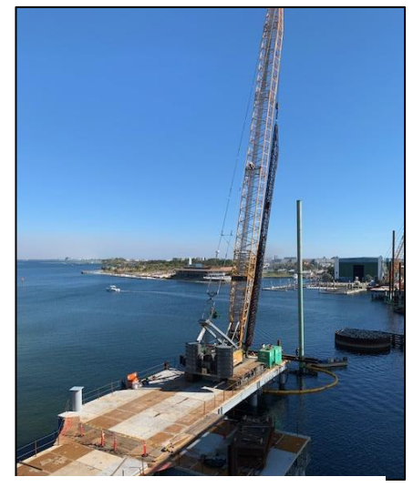
Brooks Bridge Pile Driver Fort Walton Beach Side

THE BROOKS BRIDGE PILE DRIVER RHAPSODY D – Composed by the Florida Department of