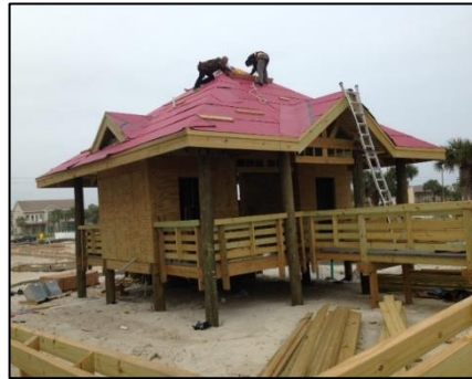
MAIN PAVILION – RESTROOMS