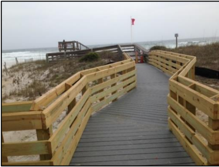
BOARD WALK TO THE BEACH

UPDATE ON ISLAND BEACH ACCESSES CURRENTLY BEING IMPROVED – FOLLOWING PHOTOS ARE OF BEACH ACCESS NUMBER 5 (Located between Island Echos and Emerald Isle Condos) TAKEN ON MARCH 30, 2018