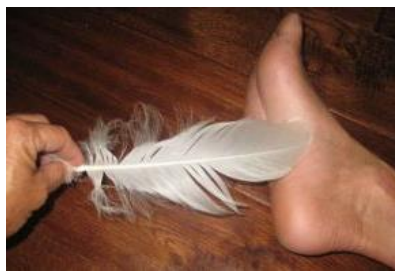
"Pain"- less Operation