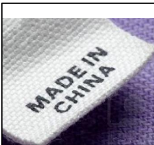
Made in China