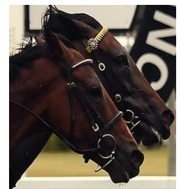
Won by a Nose