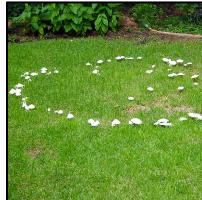
Fairy Ring in a Circle?