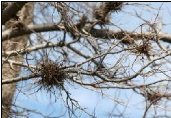
Witch's Broom (Growth Disorder) in a Tree