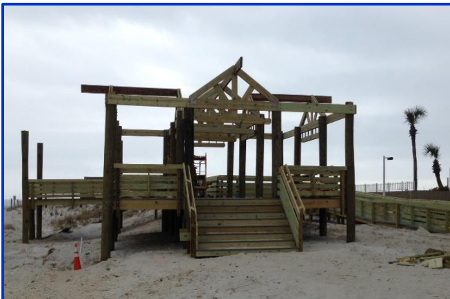
Beach Access No. 5 (located between Island Echos and Emerald Isle Condos as of February 10, 2018