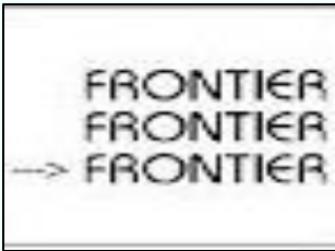
Wuzzle No. 1