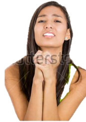
Pretty Please, With Sugar on Top