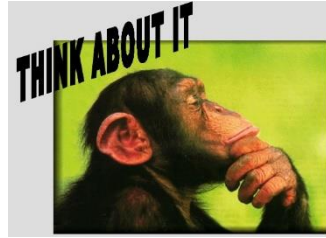
Think About It