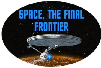
The Final Frontier