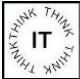
Wuzzle No. 2