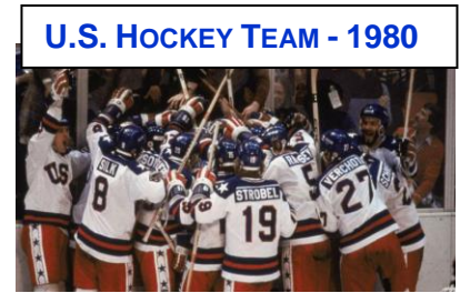
Over Come the Odds

LOST WORDS FROM OUR CHILDHOOD: WORDS GONE AS FAST AS THE BUGGY WHIP! SAD REALLY, WE ALL SAID THE WORDS READ THEM AND REMEMBER!!!! (IF YOU ARE OVER 60 THIS IS FOR YOU!)