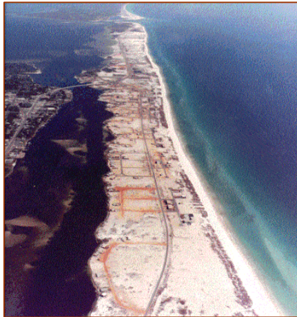
Okaloosa Island –1965. The red lines are the red clay road base for Sailfish, Seahorse and Tarpon