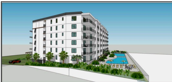
WEST ELEVATED GRAPHIC - 1