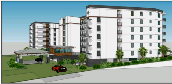
WEST ELEVATED GRAPHIC - 2

Mr. Ed Stanford , PE, Core Engineering & Consulting, briefed the Leaseholders at the December 14 meeting on the pending construction of a new condo on the currently vacant Coquina Isle lot. The condo will be 75 feet high (six stories) and consist of 47 units. Below are architectural renditions of what the new condo will look like. Mr. Stanford estimated that the size of the individual units would be in the 1,800 to 2,200 square foot range. An earlier request for the partial vacation of Scallop Court has been approved after which an application was submitted to Okaloosa County for a development order to construct the new condo.