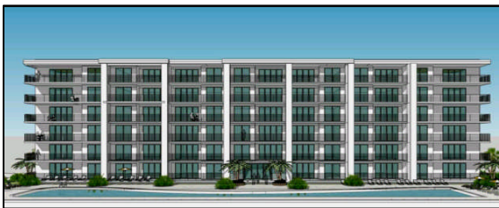
REAR ELEVATED GRAPHIC