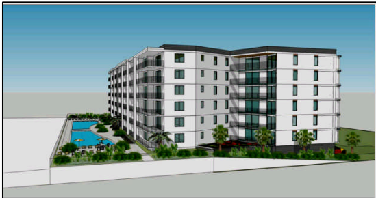
EAST ELEVATED GRAPHIC